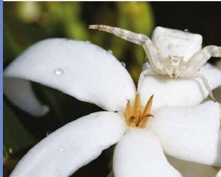
Café Marron (Rodrigues)