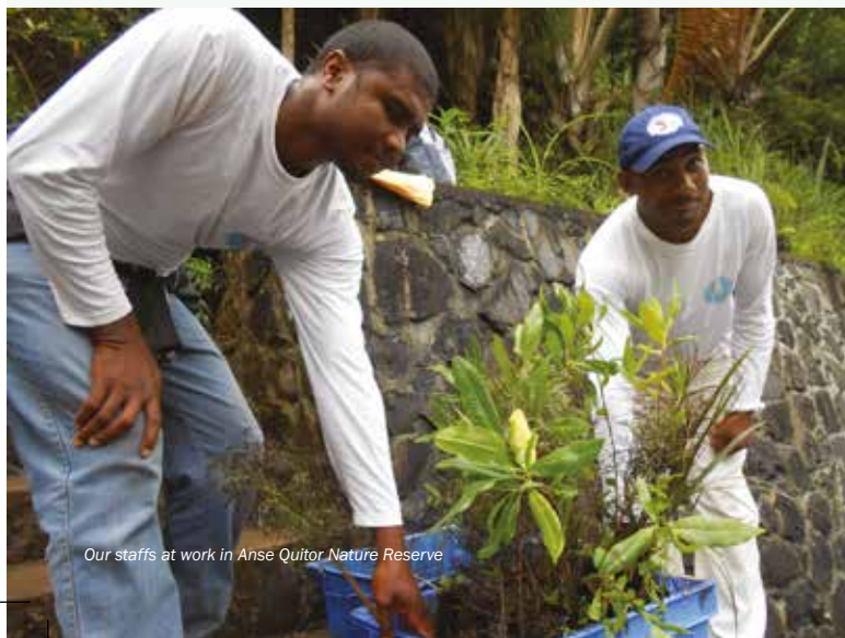
Our staffs at work in Anse Quitoir Nature Reserve